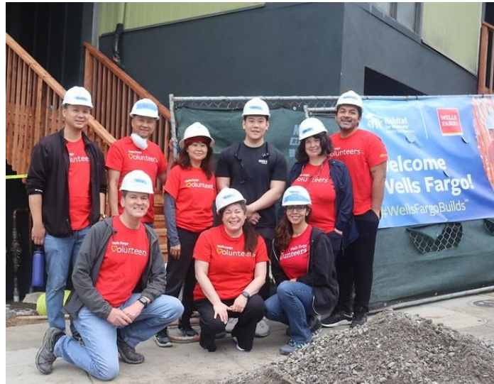
Wells Fargo volunteers on-site at Amber Drive in September 2023

With this grant through Wells Fargo Builds, plus their dedicated teams of employees who have volunteered countless hours, Habitat Greater San Francisco is able to expand its reach and fulfill its mission of building more homes and preserving homeownership for more families in the Bay Area.